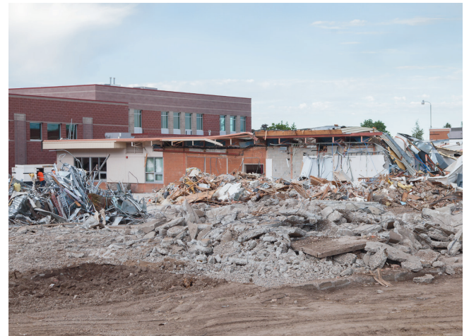
Photo of the old Edgemont building coming down on June 21, 2017

Excavation, concrete and masonry crews continue to progress well at the Provost project. Plumbers and electricians are also working daily to install under-slab systems. Major utility lines for fire line supply have been replaced and installed at connection points leading from 900 East to the adjusted Provost site. MHTN Architects and their engineering team continue to coordinate and implement input from Provost administration, school board representation and community recommendations. Hogan Construction is the Construction Manager for Provost. Their expertise with building schools on acreage-challenged sites has been a significant advantage for the Provost project.