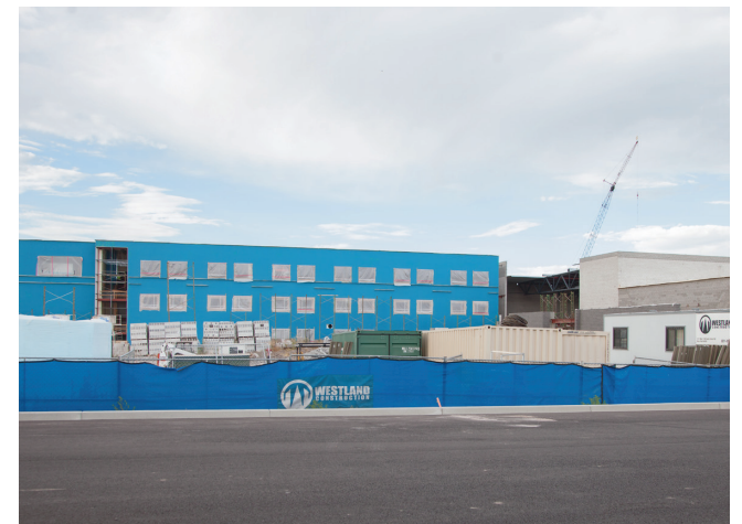
Photo of academic wing at Provo High on June 21, 2017

events. Structures for 3 academic wings are in place. CTE / Shop areas are well underway at the north end of campus. Exterior Glass systems are being installed, brick veneer installation is also underway and significant progress is being made with the new Performing Arts area of campus. Progress also continues with new road access to the north of campus, 1280 North, and a future road leading south west, which will have access from the student & visitor's parking lot on the