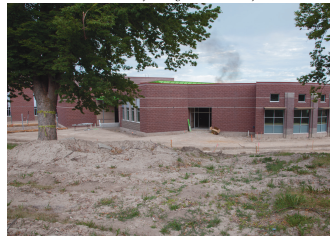
Photo of the Edgemont Elementary on June 21, 2017

FFKR Architects and their Engineering team continue to coordinate with PHS administration and faculty for efficient designs. Backstops for baseball and softball fields are installed. Landscaping crews continue to install sprinkler systems at the new baseball, softball and practice field areas. The new tennis courts are installed with fencing. There will be 8 new courts for PHS which will allow them to host Region Tennis