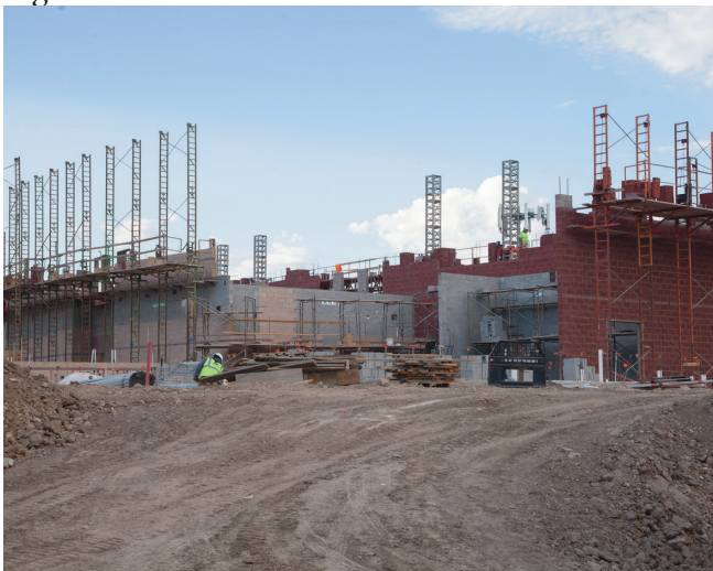
Photo of Provost Elementary on June 21, 2017

Work continues on building the new Provo High School, Edgemont Elementary School and Provost Elementary School. The completion of these schools, along with newly opened Sunset View Elementary and Rock Canyon Elementary, will conclude the work done with the voter approved bond in November of 2014. We are continually grateful to the citizens of Provo for allowing Provo City School District to provide these new buildings for Provo students.