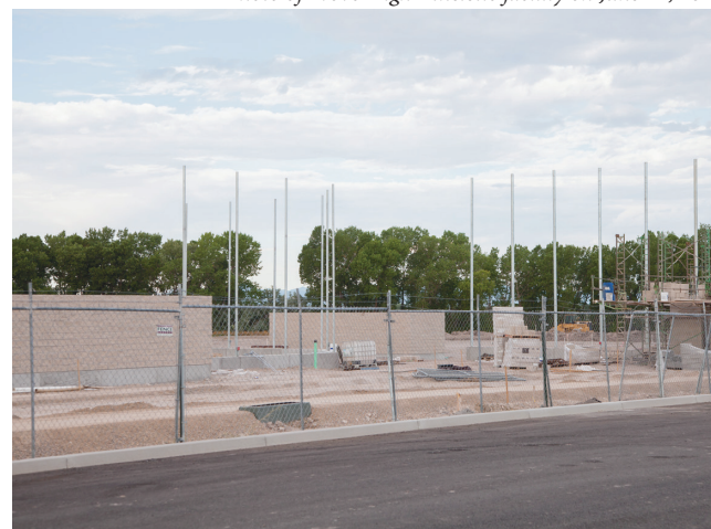
Photo of Provo High Athletic facility on June 21, 2017

south end of campus. Both of those new roads will eventually connect to the new Parkway that will lead north and south to the west of the new PHS campus. Westland Construction is the Construction Manager. Their overall expertise with construction scheduling and financial management continues to help maintain project guidelines within budget and scheduled completion.