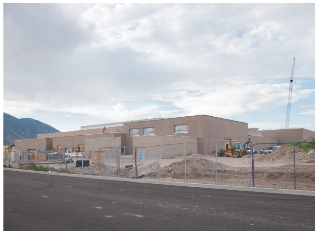
Photo of Provo High on June 21, 2017

south end of campus. Both of those new roads will eventually connect to the new Parkway that will lead north and south to the west of the new PHS campus. Westland Construction is the Construction Manager. Their overall expertise with construction scheduling and financial management continues to help maintain project guidelines within budget and scheduled completion.