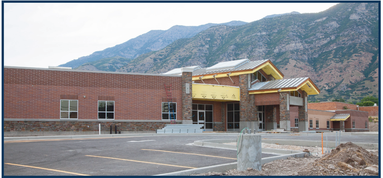
Photo of Rock Canyon Elementary on June 22, 2016

Outside, the ground is being leveled in preparation for landscaping and the installation of the parking areas. Both sites are beginning to clear up, as much of the equipment has been removed or relocated.