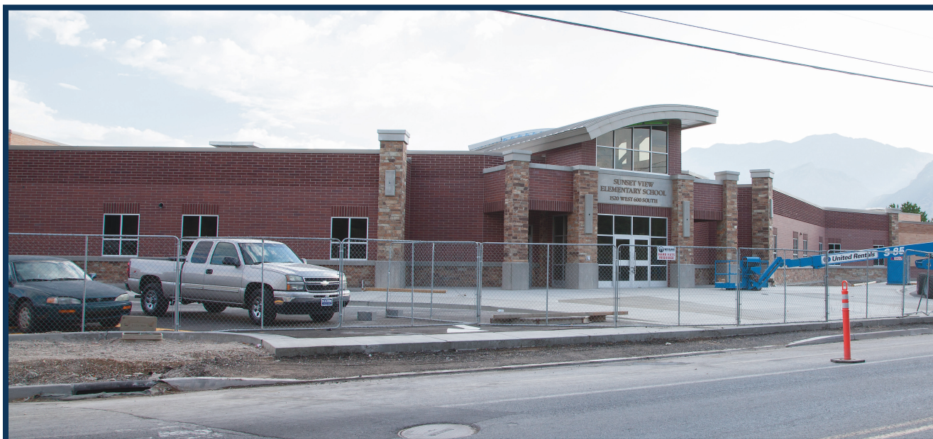
Photo of Sunset View Elementary on June 22, 2016